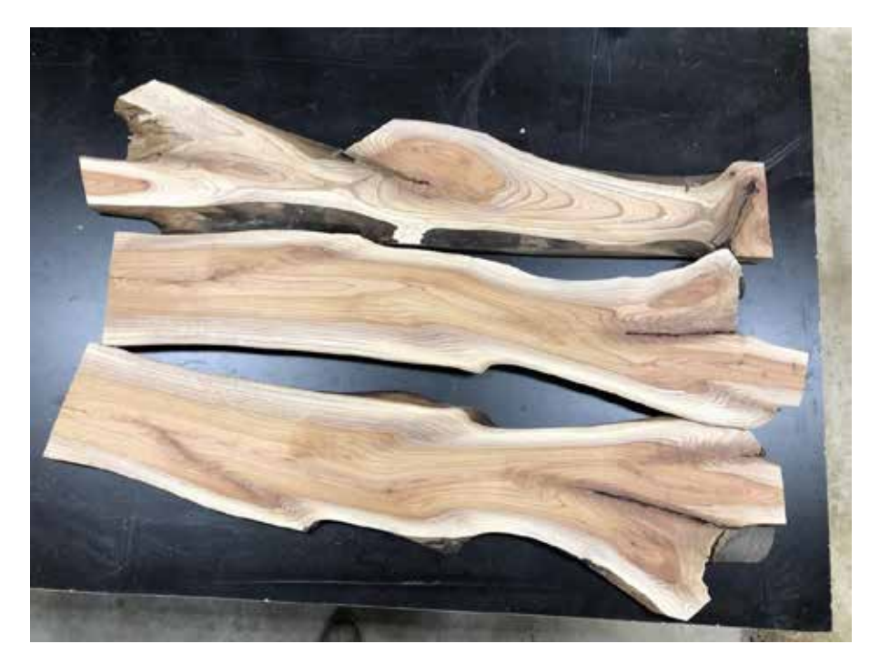
Figure 1. Zelkova wood planks in the wood shop (2021).

The wood is from trees with deep roots in Detroit, growing in soil that contains memories of the land, even before Detroit became Detroit. The Zelkova trees were cut and milled from wood to lumber which extended their life cycle (see Figure 1). The trees' new form allows for the exploration of its transition to artifacts examining the past, present, and future of African American experiences in Detroit. An urban tree's place, location, and role as a cultural landmark can be embodied in the artifacts they become.