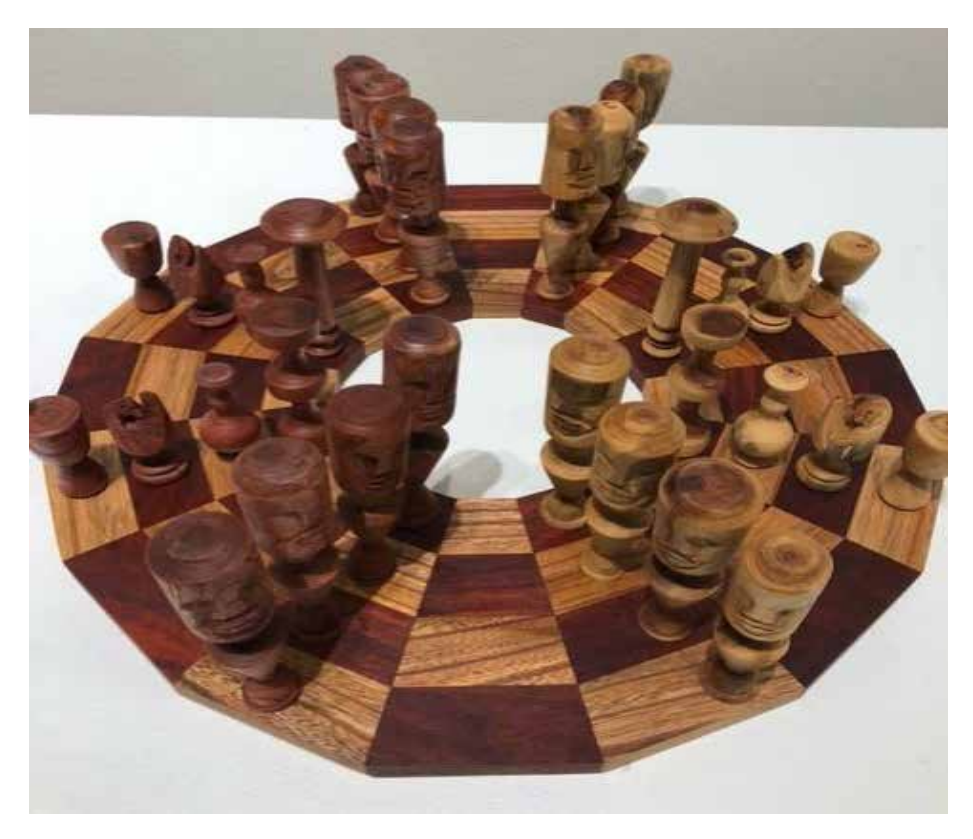
Figure 2. Faith Serio (2021), Decolonized Chess Set [sculpture: Zelkova wood].

The piece explores the notion that colonization is so deeply rooted in society that it goes unrecognized. She deconstructed the traditional European influence of chess to address imbalanced power dynamics and created rules based on a collaborative process that revolves around community, liberation, and humility as opposed to dividing, conquering, and dominating. The chessboard here is circular to reflect the African drum and dance circles. The pawn, which traditionally is the weakest and smallest piece, is recast as the largest to show its potential and importance within the community (Faith Serio, maker statement, 2022).