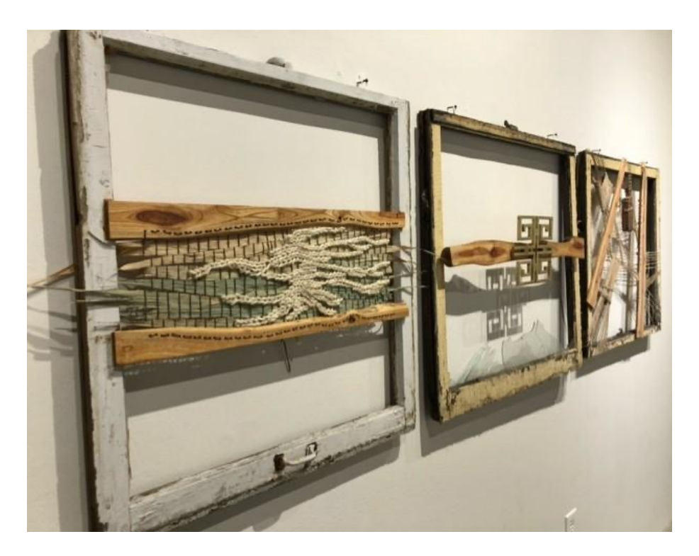
Figure 5. Lily Kline (2021), Untitled [mixed media sculpture: Zelkova wood, reclaimed windows, jute, bronze, leaves].

Other works included Cosmogram/Tesseract by community member and artist Reuben Telushkin. It is a rumination on nonlinear narrative: the syncopation of repeated layers of the same shape until a critical mass of redundancy of layers is achieved, creating "...a viewing experience wherein there is no front or back, no beginning or end, no natural point for the eye to rest" (Telushkin, 2022). What is seen depends on the point of view: